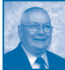
WORLD WIDE NEW TESTAMENT BAPTIST MISSION