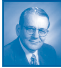
FIRST BIBLE INTERNATIONAL