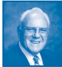
BAPTIST WORLD MISSION